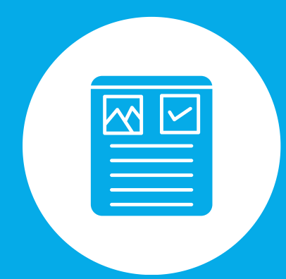
Click to read an article